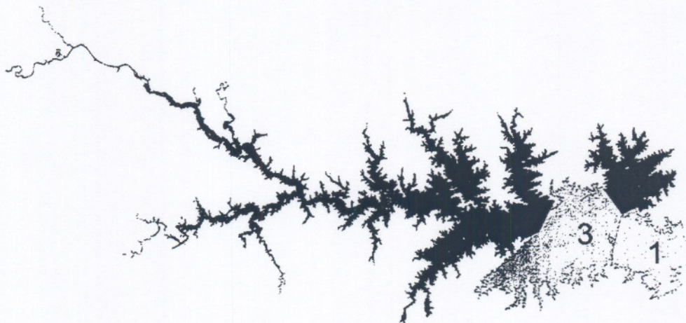
Figure 1. Lake Murray Boat Count Areas