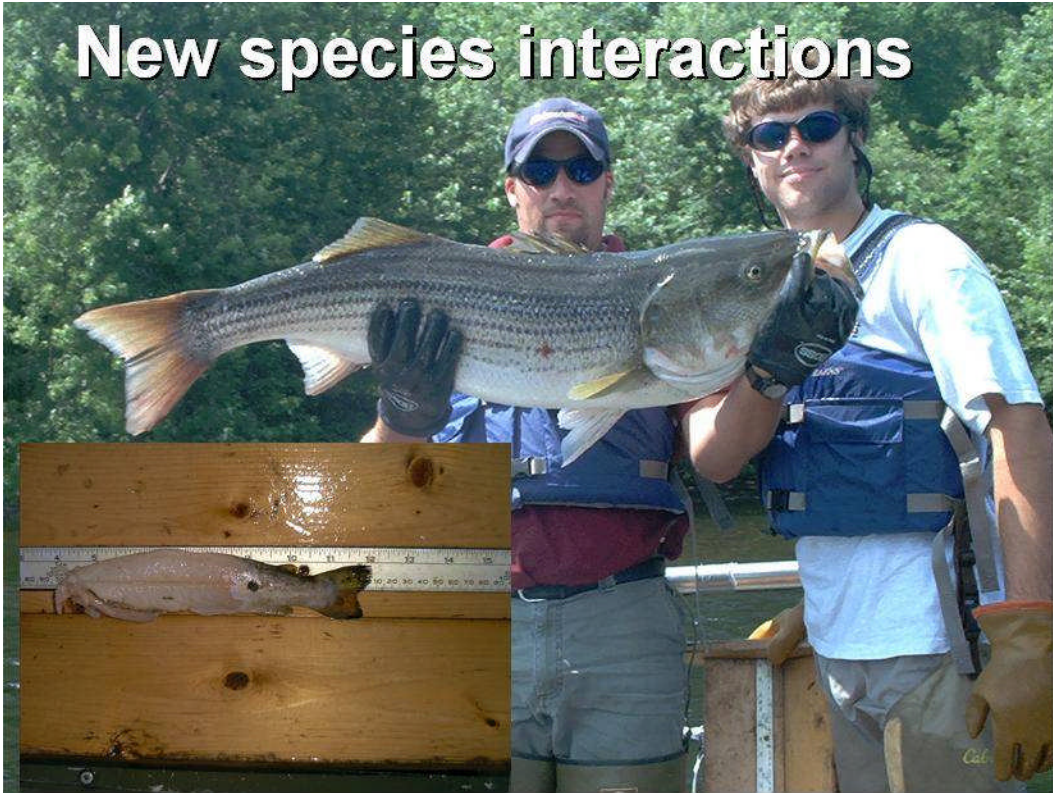
Photo 3: Remains of a 14-Inch Adult Brown Trout Expelled from Stomach of Adult Striped Bass, Lower Kennebec River, Maine, August 2002 (from Yoder and Kulik, 2003)