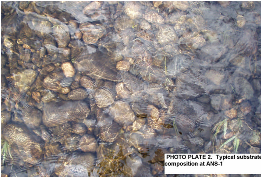
Photo 1: Example of Unimbedded Gravel Spawning Bar Substrates Used by Salmonids, Kennebec River, Maine

trout successfully reproduce, these other fish species would prey on the eggs, fry and juveniles as well.