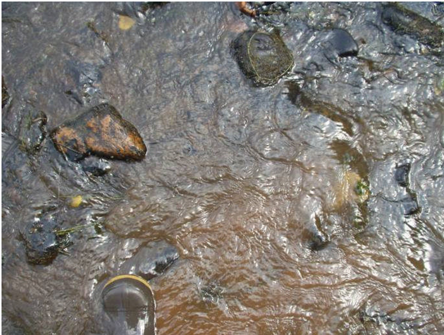
Photo 2: Example of Embedded Substrate in Oh Brother Rapids Area, Saluda River, SC